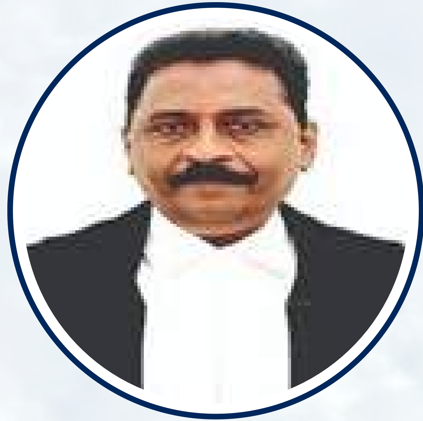
HON'BLE THIRU. JUSTICE M. GOVINDARAJ Former Judge Madras High Court