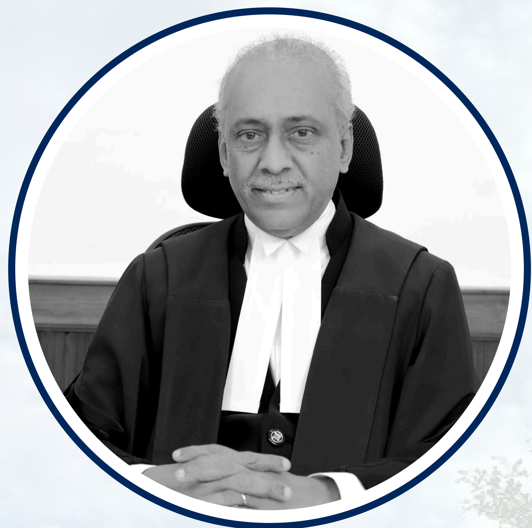
HON'BLE JUSTICE V. RAMASUBRAMANIAN (Retd.) Judge, Supreme Court of India